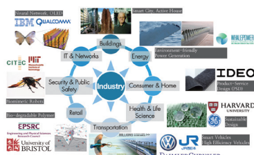
Fig. 1. Industrial Fields of Biomimicry and Its Design Cases

Bio-inspired design is the design method encouraging breakthrough innovations by stimulating analogical reasoning of designers. However, most of the time, designers choose wrong metaphors to do the bio-inspired design. As long as they are novice in natural science, this problem cannot be solved. To resolve this problem, the recommendation system has been developed and evaluated. Specifically, the representation framework that stores biological characteristics of BSs at the holistic perspective of ‘physical, biological, and ecological relations’ is redesigned and the retrieval system that is operated on the representation framework is implemented for designers. The representation framework was complemented by the systematic indexing mechanisms and the causal model based ontology. This research could dramatically increase the solution space of designers and guide the designers to choose appropriate metaphor from the nature.